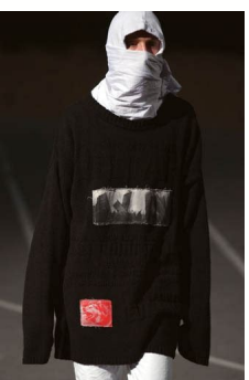
Raf simons new york times. Raf simons new york sweater. Raf simons new york hoodie. Raf simons i love new york sweater.